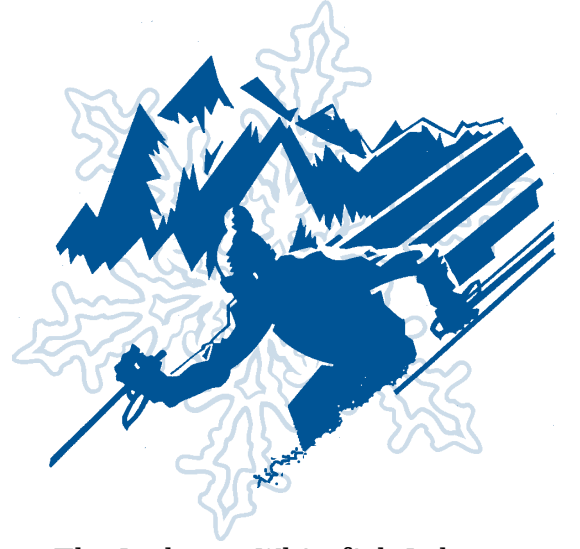
The Lodge at Whitefish Lake Whitefish, Montana