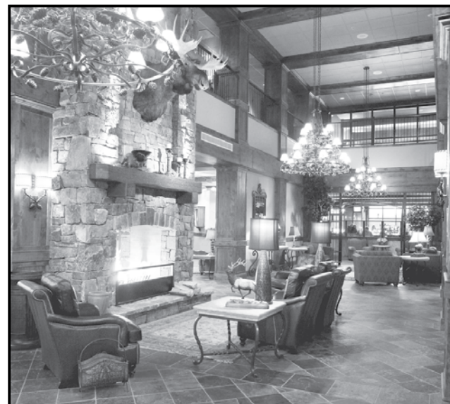
The Lodge at Whitefish Lake